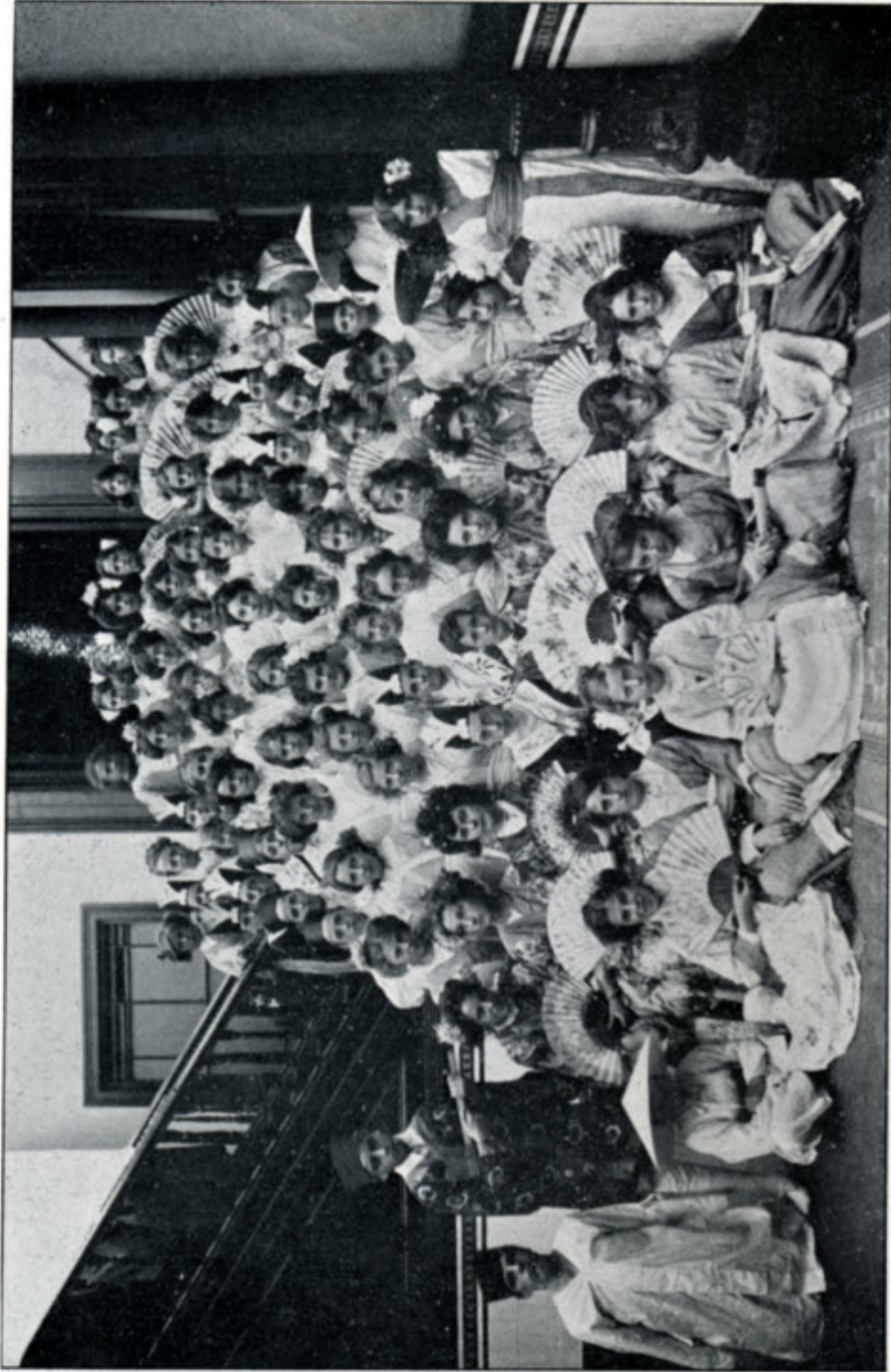
School Operetta—"Sunrise Land"